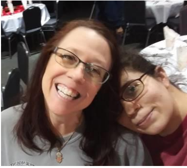
Purim Room Set Up – Check out these table setting divas and these Purim Ninjas!