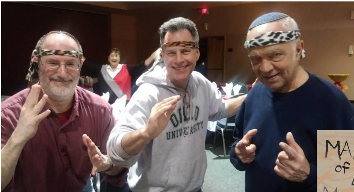
Setting the room for 200 people can make anyone a little crazy but we were all smiles!