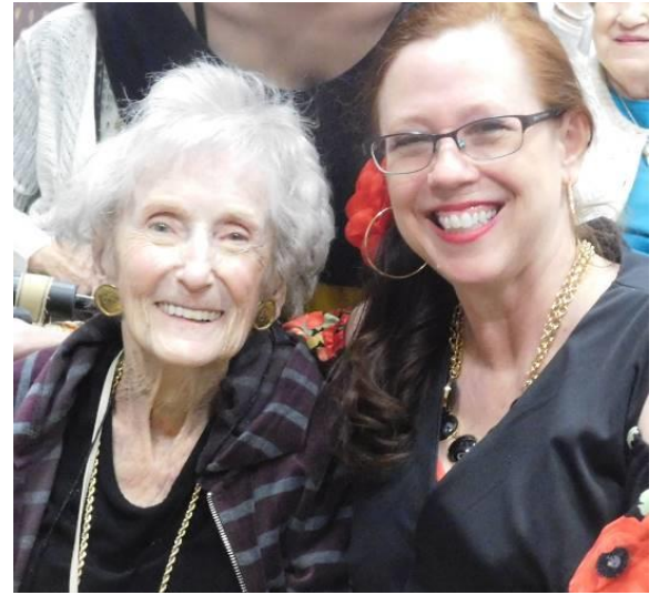
Social Action in its many forms. Check out the smiles on the faces of these Cedar Village residents – not to mention our cast members! Sunday, 3-24-19